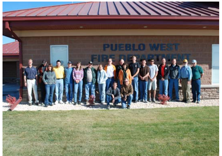
Figure 1: Pueblo MLSO Class Nov 2008