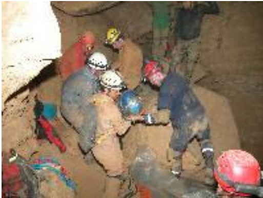
pand their knowledge and experience into the specialty of cave rescue. Our seminars usually have an equal mix of cavers and search and rescue (SAR). No previous experience in caving or SAR is required.

cue. The class is geared to both cave explorers who desire to learn the basics of rescue and rescue personnel who wish to ex-